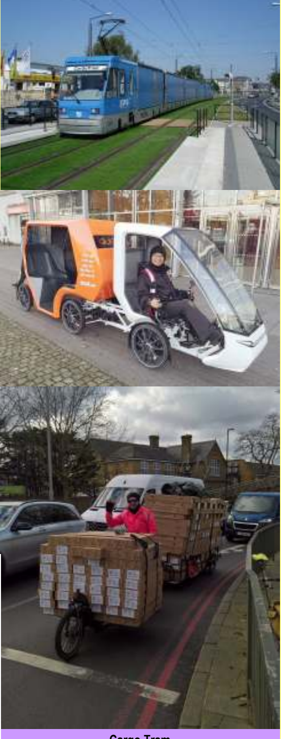
Cargo Tram Gothenburg Taxi Pedal Freight