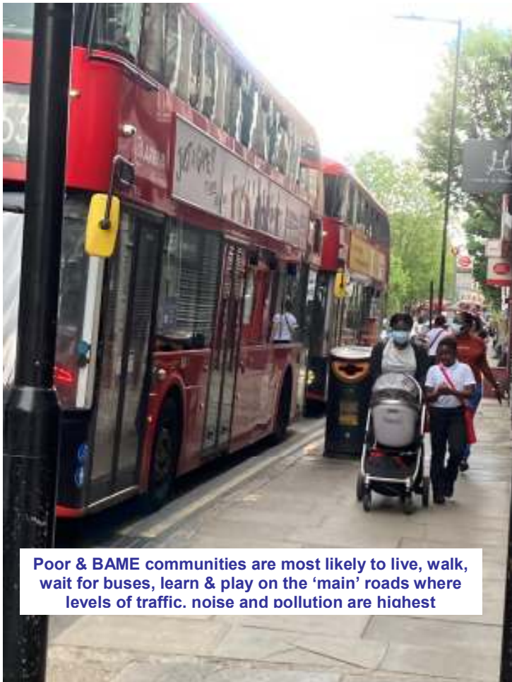
Poor & BAME communities are most likely to live, walk, wait for buses, learn & play on the 'main' roads where levels of traffic, noise and pollution are highest

Many of us spend a lot of time on main roads: at work; at school; shopping and socialising; waiting for buses; meeting friends; simply walking. Poor & BAME communities are most likely to do so. Little money, and very often no car, means they leave their own neighbourhoods less often than wealthier people do. It is interesting that the residents of main roads are rising up, really for the first time in decades, and saying 'enough is enough', with many of campaigns being led by members of the BAME communities.