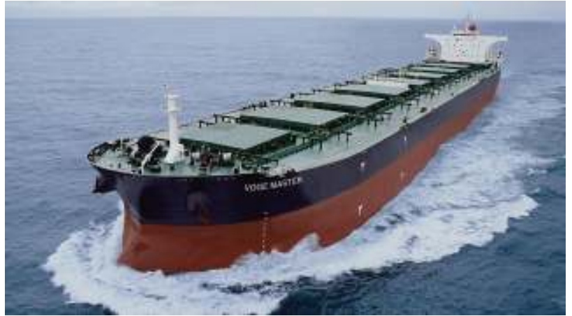
Although sonar testing and pile driving cause noise problems in the ocean, shipping is the main culprit

The natural sounds of the ocean are magnificent in their range, beautiful in their delivery and stunningly varied. But these sounds are in danger of being overwhelmed by human noises and vibrations as never before. It is whales and dolphins which can be especially badly affected. With limited sight and smell, sound is all-important for them. Since they often communicate over long distances, their chain of communication is particularly vulnerable to human-induced noise. A particular problem arises if mammals are communicating at the same low-frequencies as 'man-made' noise.