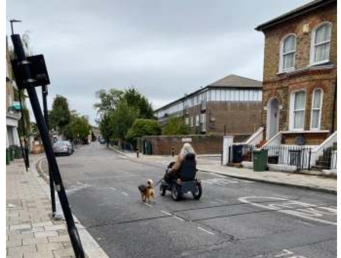
LTNs create quieter neighbourhoods but often at the expense of more traffic on adjacent roads

Unlike older LTNs, which tended to cover just better-off areas, many of more recent ones include poor places as well as rich ones but there are real equity concerns around their impact on boundary and main roads. In London, where the bulk of the research has been carried out, 8.5% of the population lives on main roads; that is, about 720,000 people.