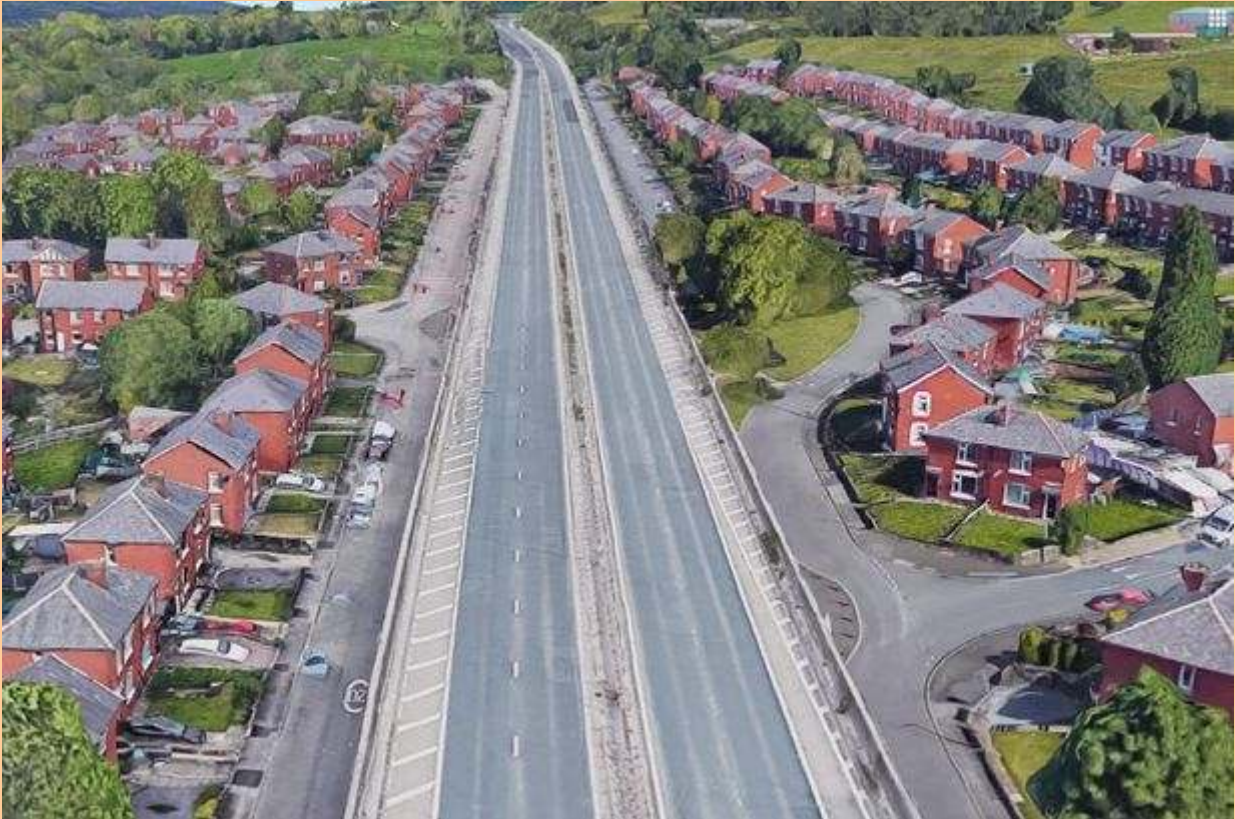
The M66 runs through the middle of the Dicky Bird estate in Bury