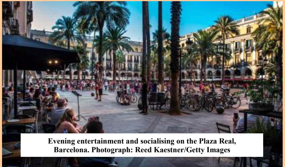
Evening entertainment and socialising on the Plaza Real, Barcelona.