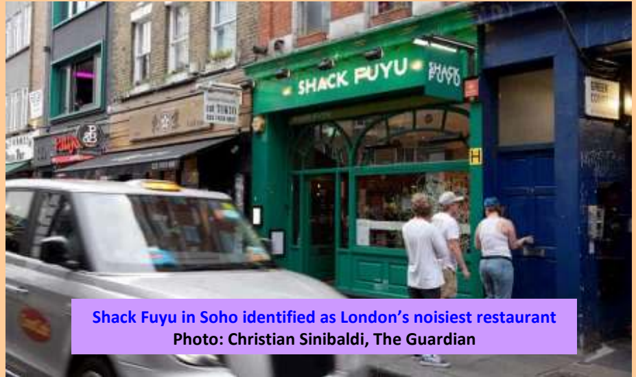
Shack Fuyu in Soho identified as London's noisiest restaurant

Cutlery clanging on plates, chairs scraping across a hardwood floor, the boisterous anecdote of a half-cut raconteur: when it comes to restaurants, one person's idea of a "good atmosphere" has another reaching for their earplugs. But for those who like their food served up along with the decibel levels of a motorbike or lawnmower, London is the place to be. Data released this week reveals that the capital's restaurants are the loudest in Europe, and second only to San Francisco worldwide. A random survey by SoundPrint a global app measuring noise levels, found 80% of 1,350 London restaurants were too loud for conversation.